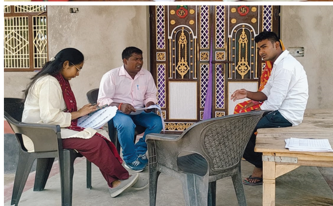
A field day at work for the BLOs